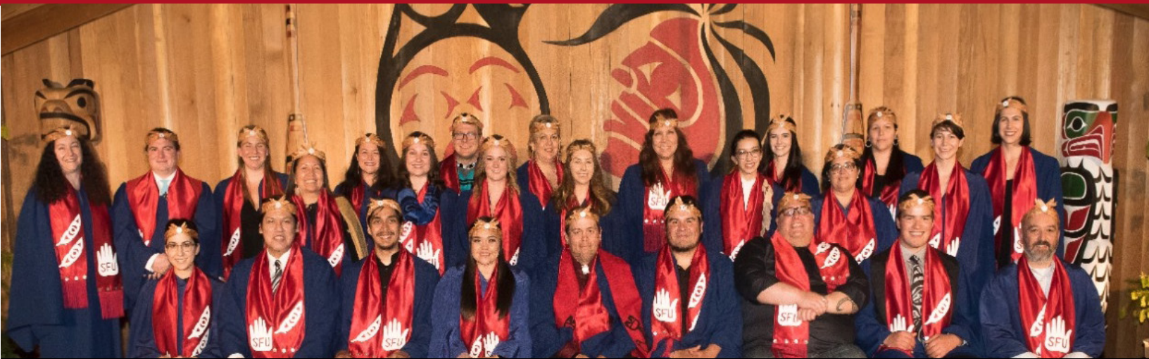
Congratulations to the Indigenous graduates who celebrated at the 2018 Honouring Feast.