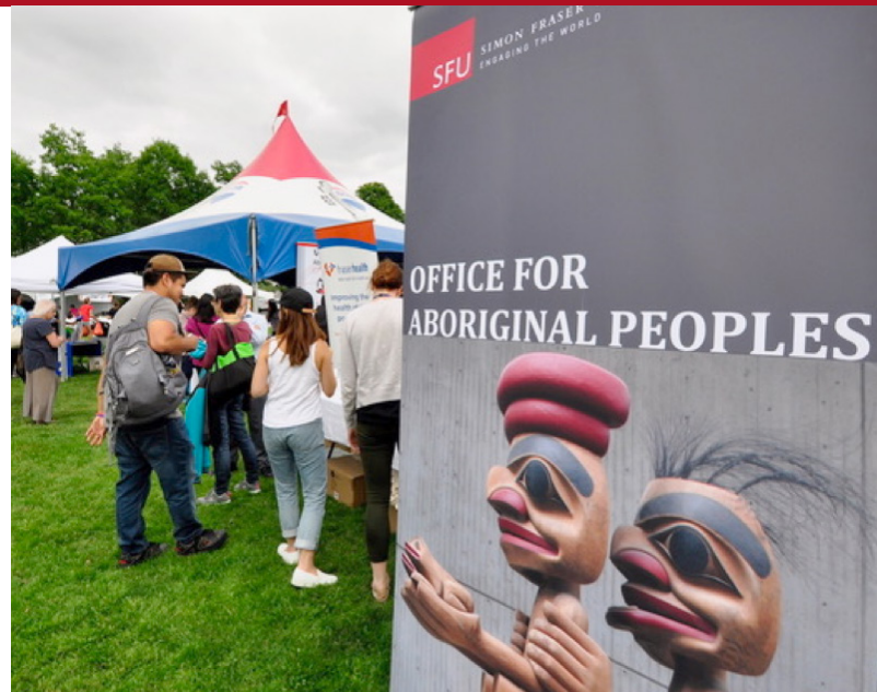
SFU's Information Booth at Surrey's National Indigenous Peoples Day.