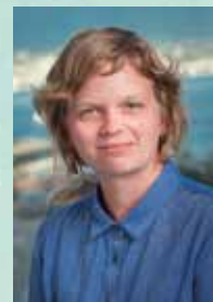
Gerilee McBride Design & Communication